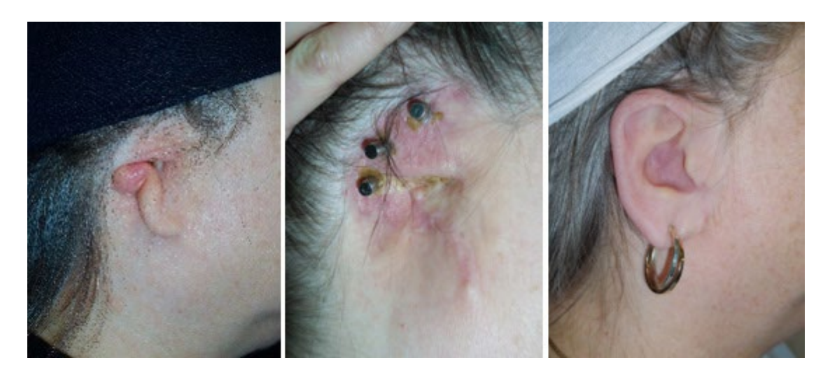
Caption: Missing right ear, reconstructed with silicone ear attached using Southern boneanchors inserted in 2019.